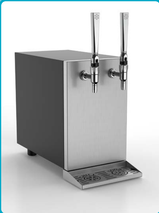
AQUA COUNTERTOP 60